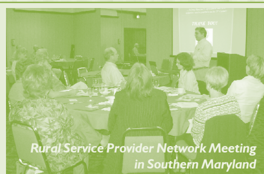
Rural Service Provider Network Meeting in Southern Maryland