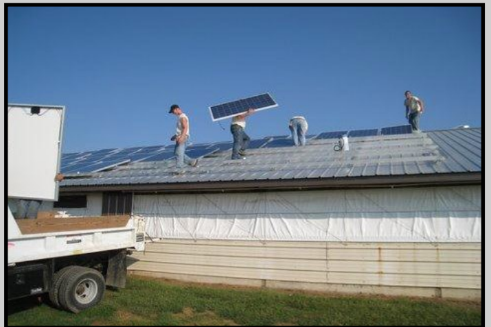
Pictured above left: Chickens being raised on the Khan poultry farm in Wicomico County (MRBIFF Program). Above right: Energy efficient solar panels being installed at Flintrock Farms in Queen Anne's County (Rural Business Energy Efficiency Improvement Loan Fund Program).